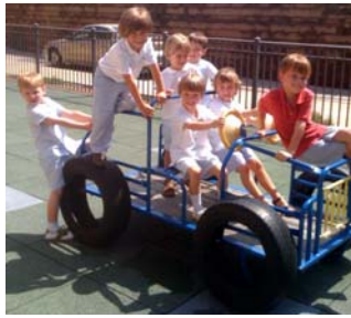
Five year-old Sunday School Class hanging out on the OU playground.